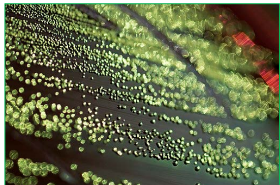
Escherichia coli growing on Eosin methylene blue (EMB) media with its distinctive green metallic sheen.

Congratulations also to Gene Drendel, international runner up in the microscopy section.